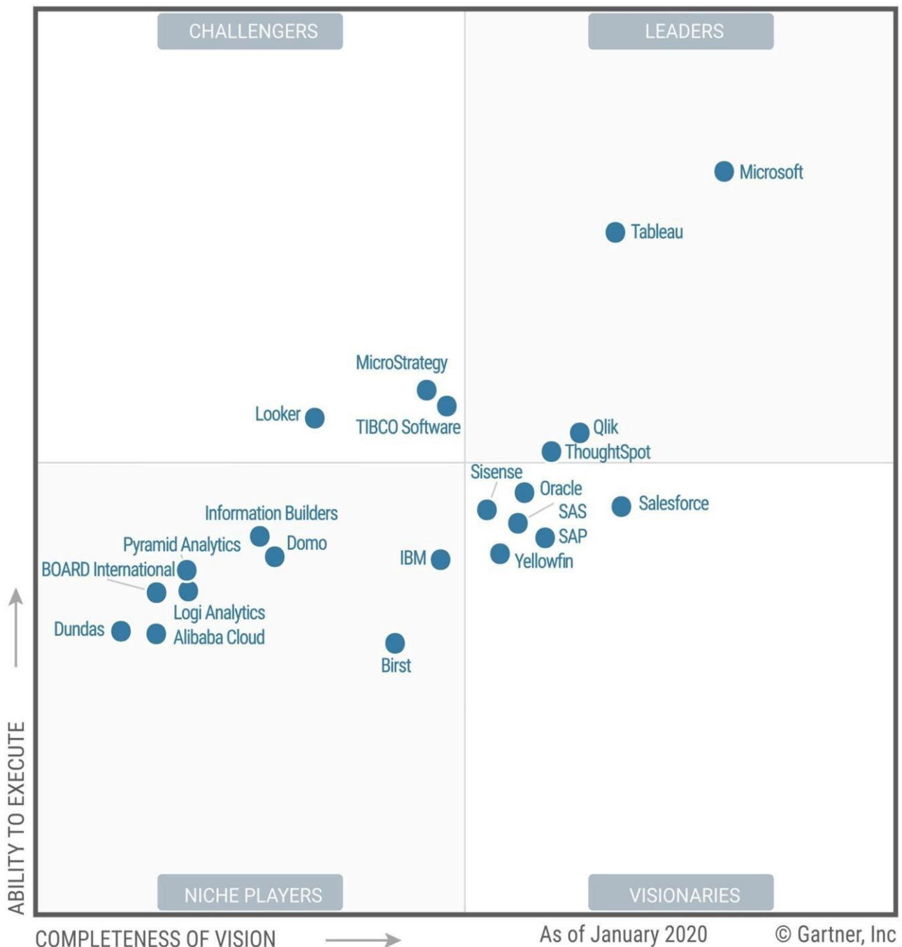
Figure 1. Magic Quadrant for Analytics and Business Intelligence Platforms