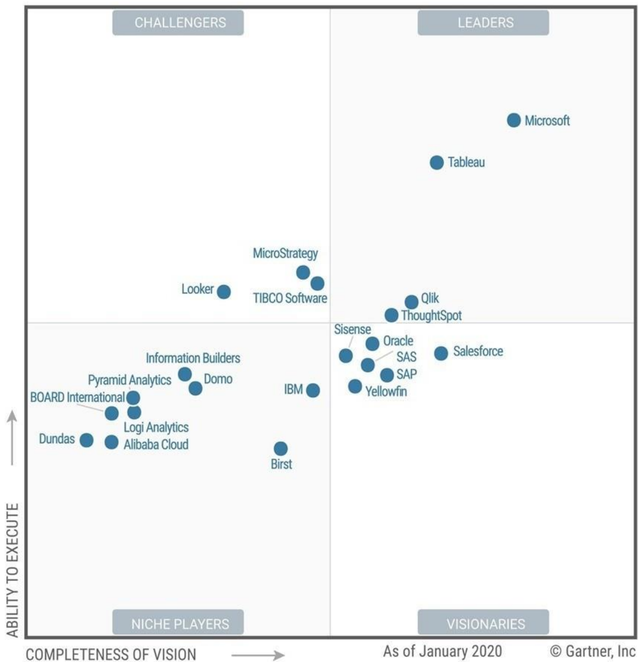
Figure 1. Magic Quadrant for Analytics and Business Intelligence Platforms