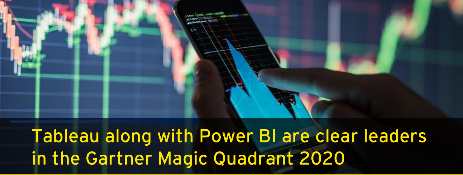
Tableau along with Power BI are clear leaders in the Gartner Magic Quadrant 2020